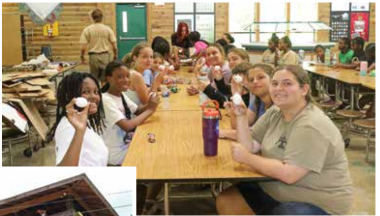
Campers preparing their eggs for the tower egg drop