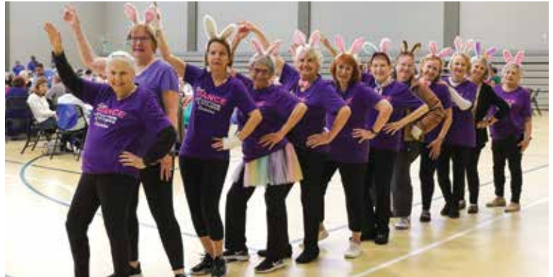
Line Dancers - Anytime Fitness Destrehan