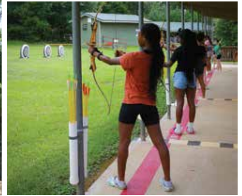
Campers practicing their archery skills